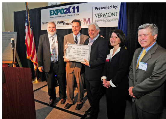
Small Dog Electronics 2010 Deane C. Davis Outstanding Vermont Business Award Recipient